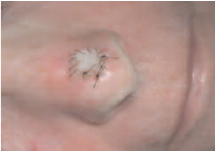
Figure 3a. Graft on Nose at 1 Week.

Case 3, full-thickness skin graft: An 80-year old female presented for treatment of a basal cell carcinoma on the left tip of the nose. After 3 stages of Mohs surgery to remove the cancer, a full thickness skin graft from the left preauricular area was used to repair the defect. Immediately after suturing, the organic polymer dressing was applied and allowed to dry. A pressure bandage was applied for 24 hours, after which the patient was instructed to remove the pressure bandage only. No additional wound care was performed by the patient. Figure 3a shows the graft at one week, the occlusive nature of the film (Figure 3b) which is formed by the polymer and the adherence of the graft to the donor site (Figure 3c).