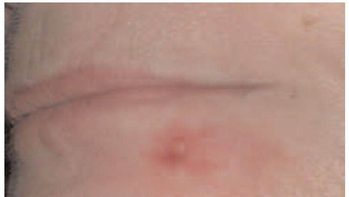
Figure 1b. Wound Area Nearly Healed at 1 Week Follow-Up.